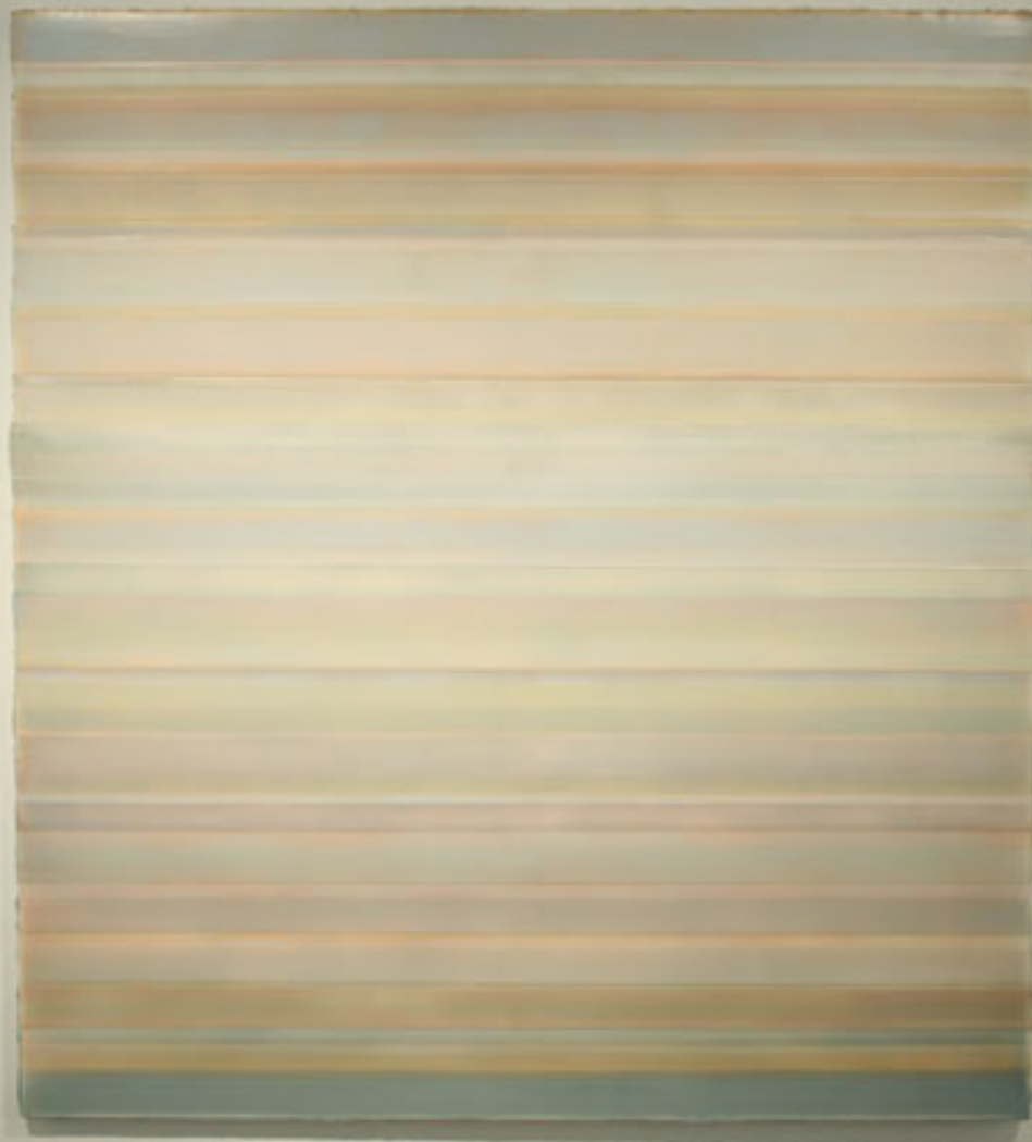
“PULSE (Between/Beyond) #12”, 2009 – Linda Day acrylic on canvas - $8,000