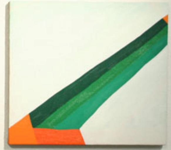
“Untitled Green Diagonal” , 2009