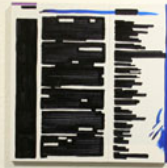
“LA Based Artist Remembering Roland Barthes Reflects on The Secret Eclipse of Protest Pictures Through The Author and Georgia O’Keefe” , 2009