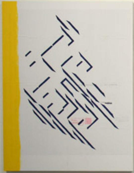
“Through you (Indigo)” , 2009 gouache and acrylic on poster mounted to panel